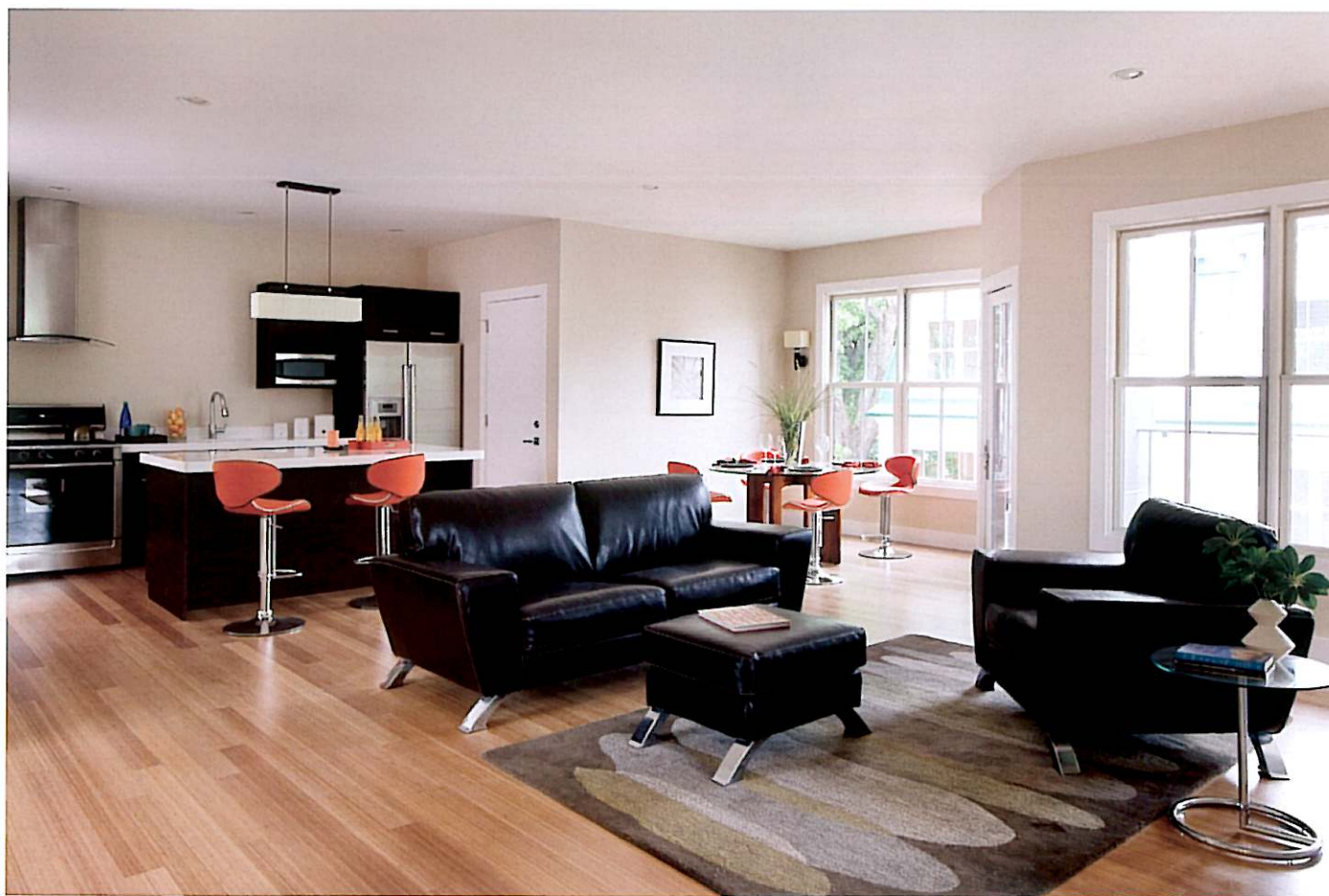
Contemporary residences built by GFC Development, Inc.

taken a leading position in promoting green projects and embrace sustainable building techniques and materials.