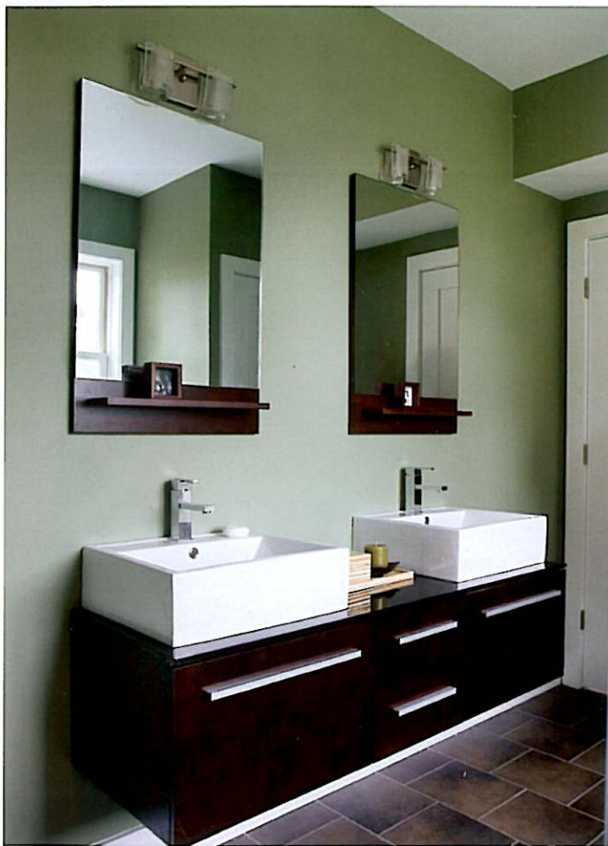
Elegant modern bathroom

cellulose and Icynene insulation, low-E Marvin windows and an Energy Star-rated HVAC system. Interiors went green with the use of low-VOC paint, bamboo floors, Energy Star appliances and low-flow plumbing fixtures. The unique exterior is a combination of Hardie board, cement siding that reduces the need for constant maintenance and Flexospan metal panels, which also are longlasting and give a distinct look.