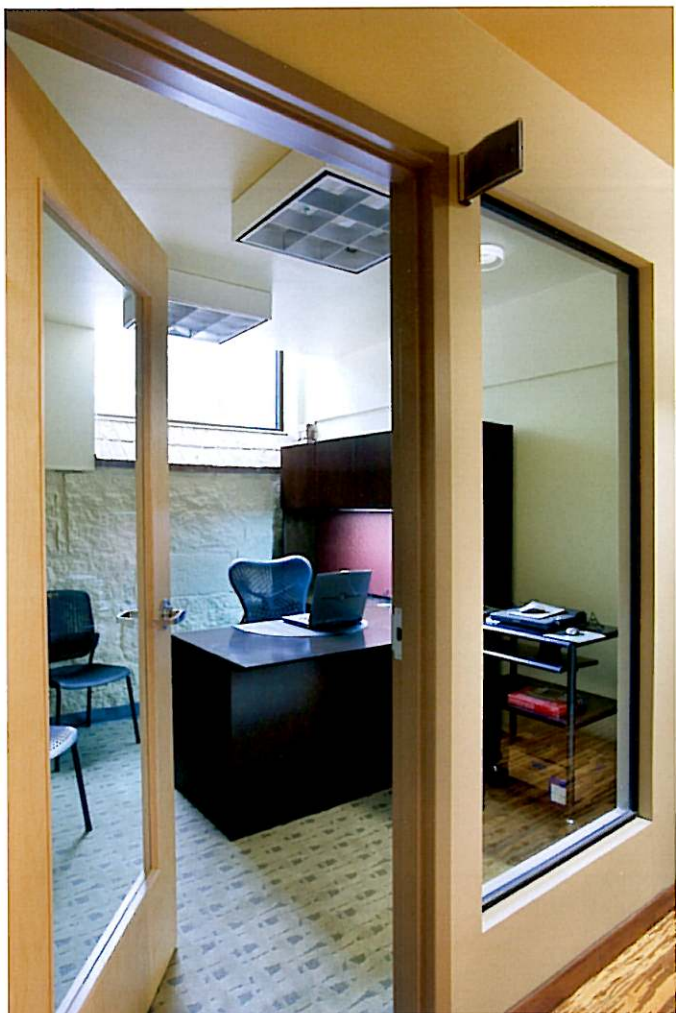
Sustainable materials were used throughout the entire project.

project to meet a client's financial goals, and that quality is one that differentiates them from other builders.