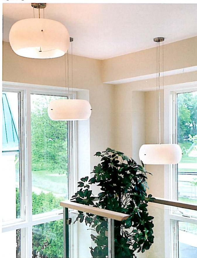
Lighting by award-winning "Best of Boston" lighting designer lucia lighting

Each is a floor through unit, with plenty of balcony space to bring the outdoors in. Units range in size from 1,450 square feet to 1,600 square feet and each has two bedrooms and two baths. Crisp contemporary design matches the high-tech features that went into these units. While the location and amenities are very thoughtful, the efforts that went into making this building energy efficient are also impressive. GFC utilized ZIP System wall sheathing, both